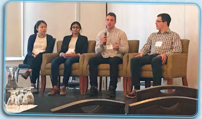
Youth Panel at The Future of Arctic Entrepreneurship, Whitehorse, Yukon.

Although the conference already has a strong student