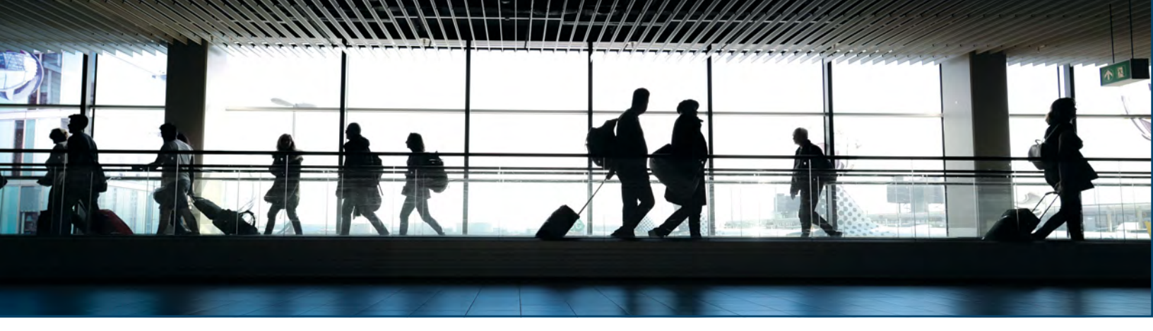
<< Travel Abuses, continued from the previous page