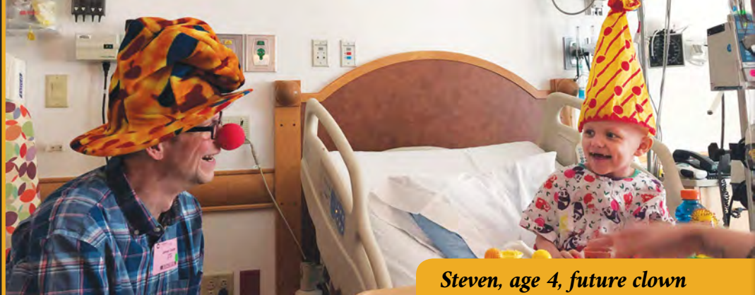
Steven, age 4, future clown