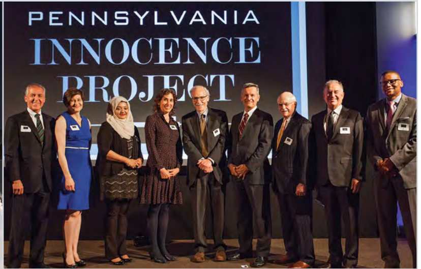
Congratulations to all of our 2017 honorees!