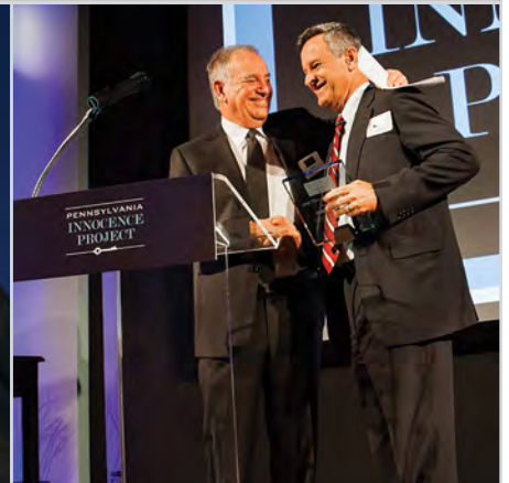
Cozen O'Connor was presented with our Hero of Justice Award for its faithful & multifaceted support of the Project, our clients, & our mission.